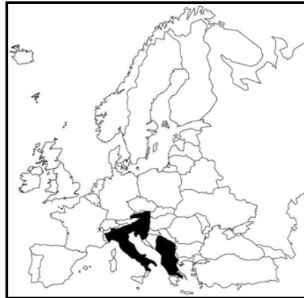
Map 2. Distribution of the Italian Crested Newt Triturus carnifex in Europe (The X on the French-Swiss border marks the introduced population near Lake Lemans)

Habitats: deciduous woodland to arid Mediterranean habitats where these occur close to still permanent, temporary waters and flooded quarries. Occurs from sea level to 2140m.