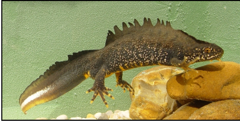
Figure 1: Male Northern Crested Newt Triturus cristatus