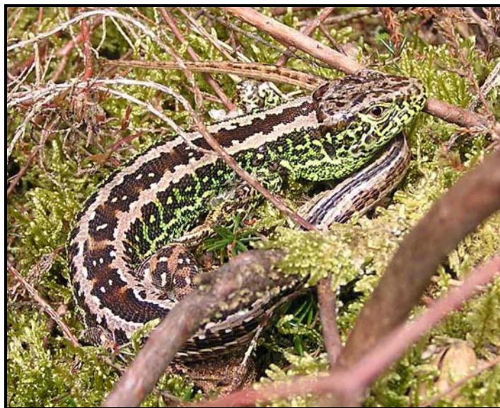
Figure 1: Male Sand Lizard Lacerta agilis agilis