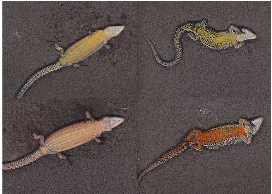
FIGURE 1 Digital photographs of the body color of individual common lizards. The individuals are an immature female (top left), an adult female (bottom left), an immature male (top right), and an adult male (bottom right)